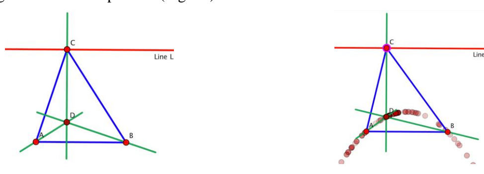
Figure 2a: Geometrical situation proposed with Cinderella (Act. 1, page 1).

The c-book is organized in three sections. The first section proposes the main activity called "Loci of special points of a triangle". It starts by inviting the students to explore, with Cinderella dynamic geometry software<sup>1</sup>, the geometric locus of the orthocenter of a triangle while one of its vertices moves along a line parallel to the opposite side (Fig. 2a). The students are asked to explore the situation, formulate a conjecture about the geometric locus of the point D and test the conjecture by visualizing the trace of the point D (Fig. 2b).