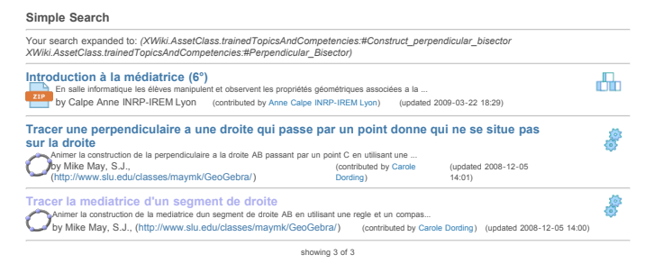
Figure 3: Exemplary search result for the construction of perpendicular bisector