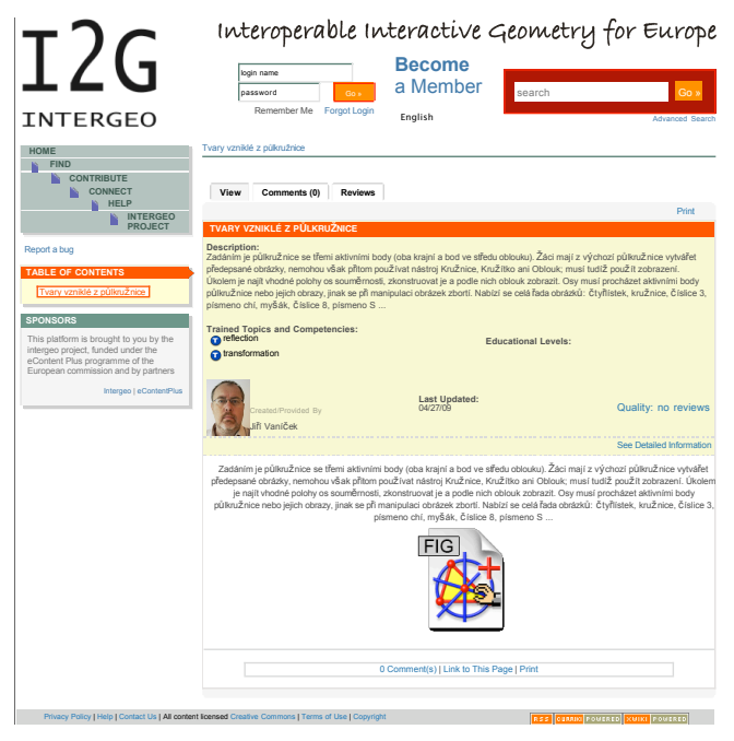
Figure 1: A very simple resource, a Cabri construction, in Czech, and its annotations within I2Geo for an English speaking user.