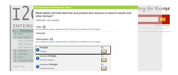
Figure 2: Annotating a resource, step 2: topics annotation.

related to the concept. We see, thus, that a more elaborate method than plaintext retrieval is needed: to allow users (both at query and annotation time) to designate the concepts they mean and for internationalization.