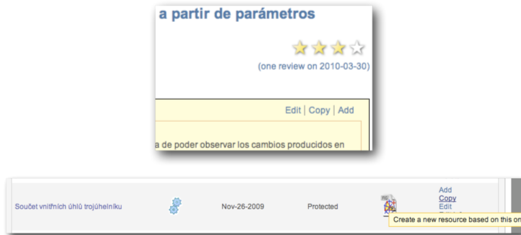
Figure 1: two occurrences of the copy link offered by the i2geo platform.

This function is followed by forms to input a revised metadata. Once filled, one obtains a resource that belongs to the current user and which he or she is invited to further modify. The resource starts a new life, in the hands of a new owner.