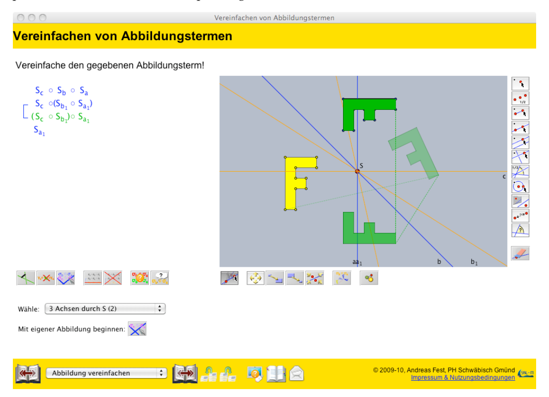
Picture 3: The laboratory on the geometric reduction theorem from the adaption of Movelt!-M to the laboratory browser framework.

Laboratory browsers implemented within our framework are freely configurable via property files. Most settings for the appearance and the available content are stored in a default property file and can be overwritten by user-defined files. This opens the possibility for a lecturer to select the available contents of an application and its presentation for his students depending on his lecture or course.